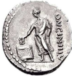
Roman Coin Depicting Election

Section bylaws require annual elections for section officers. One board member is rotated off each year and a replacement elected.