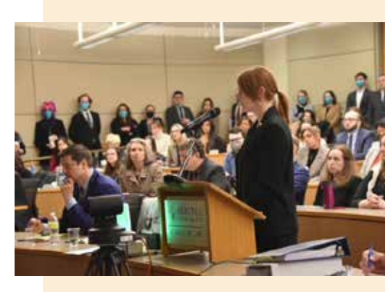
The Supreme Court holding a session at Seattle University

Finally, May will bring the court's In Memoriam service. On May 31, the court will honor the memory and