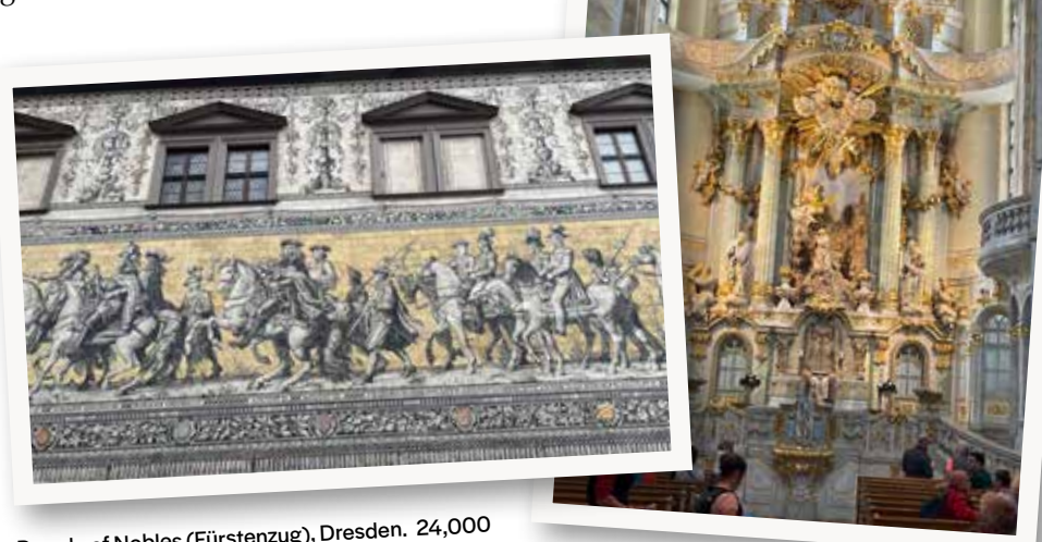
Parade of Nobles (Fürstenzug), Dresden. 24,000 Meissen porcelain tiles, fired 3 times at 2,400°F when created in 1907. Survived the 1945 Dresden bombing.

Dresden, a quaint town with an extraordinary porcelain glockenspiel