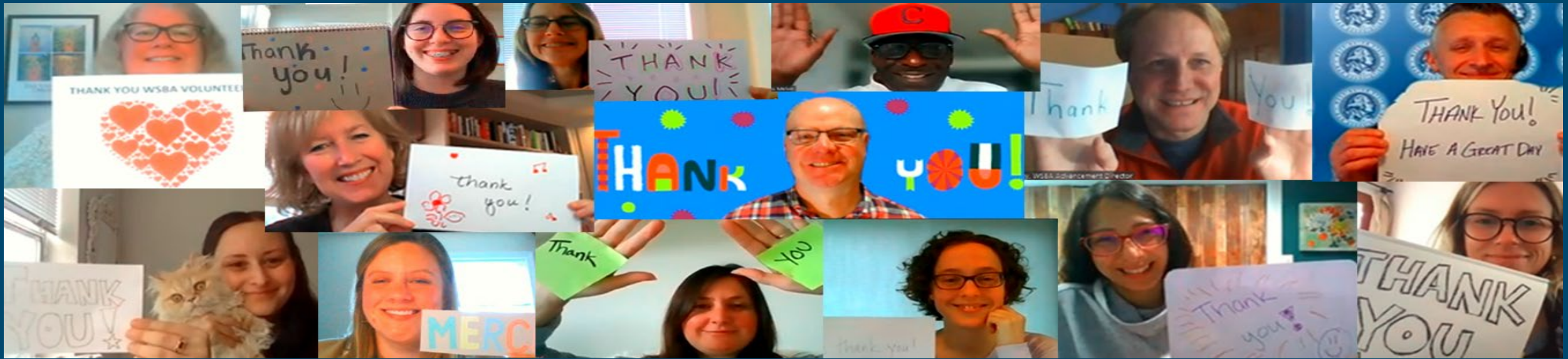
Image credit: WSBA Celebrates National Volunteer Week April 18 - 24, 2021