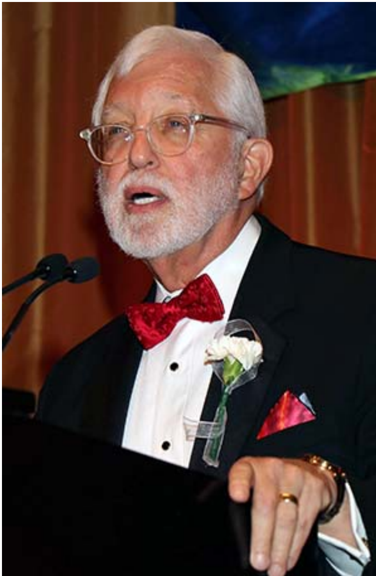
Judge Rakoff speaks at the Federal Bar Council Law Day Dinner.

Editor's Note: U.S. District Judge Jed Rakoff of the Southern District of New York received the Learned Hand Medal for Excellence in Federal Jurisprudence at the Federal Bar Council's Law Day dinner Wednesday night at the Grand Hyatt New York. He used the occasion to ask the guests to find a way to make legal services more affordable. The New York Law Journal is running his remarks on that in their entirety.