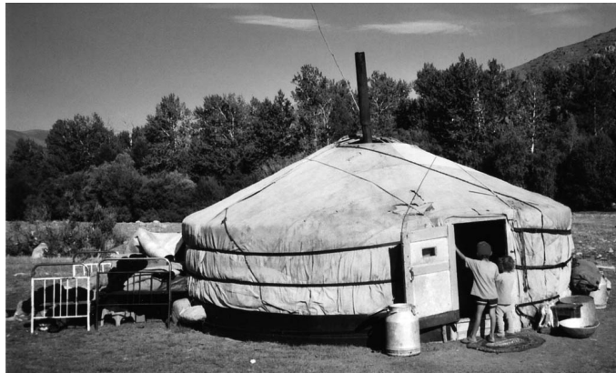
A ger (yurt) in the Tuvan landscape. Tuvans were historically a nomadic people, and some Tuvans still migrate with their animals on a seasonal basis.

The Republic of Tuva is located on the northwest corner of Mongolia. The Tuvan people have lived here for many centuries in isolation from their neighbors because of the mountain ranges on its borders. In its more immediate past,