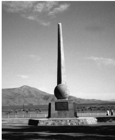
Center of Asia monument in Kyzyl, the capital of Tuva

At the end of two wonderful weeks, we were ready to return home. Pillow to pillow time on the return: 56 hours. Was it worth it? You bet! The scenery had been awesome, the weather cooperative, the sanitation questionable (there are no flush toilets outside of Kyzyl), and the food ... well, you don’t go to Tuva for its food, unless cabbage soup, potatoes, tough mutton, and dry bread are among your favorites. Tuvan wine is distilled from sour milk. Taste? Let’s just say it is a little raw. The highlights were the khoomei concerts, with the astounding variety of throat singing techniques and the beautiful costumes of the performers. It was a memorable experience, and one that rates very high on our list of trips taken to new places.