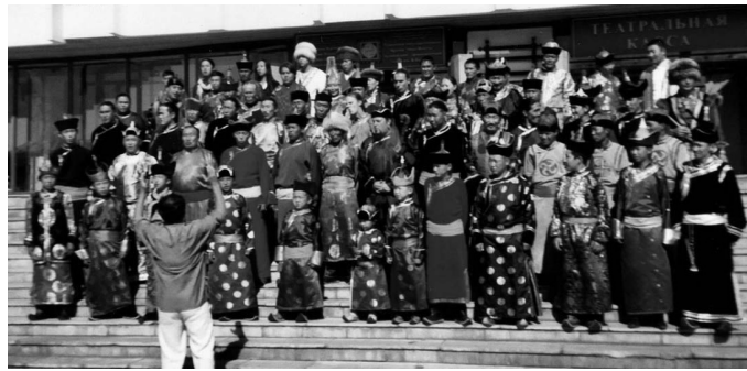
Tuvan throat singers performing on the steps of the Performance Hall in Kyzyl

The opening event of the Symposium was a concert in the Performance Hall in Kyzyl. What a surprise! The music was varied and intriguing, the costumes colorful and elaborate, their hats with pointy tips, topped by a satin knob, and the choreography graceful.