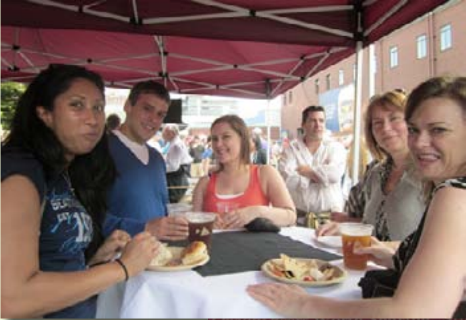
Young lawyers enjoy food and drink before attending the July 13 Mariners game together.