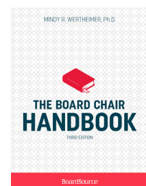
The Board Chair Handbook