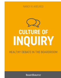
Culture of Inquiry